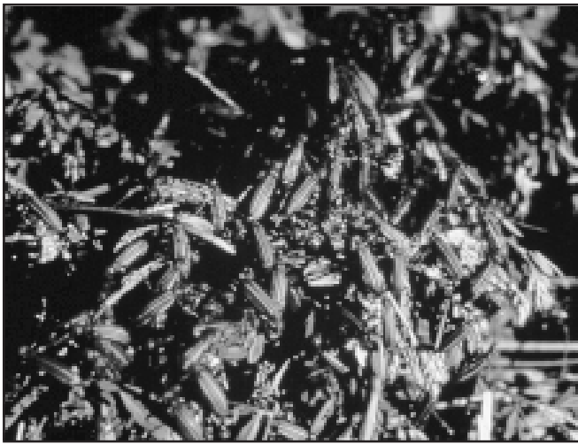
Figure 2. Part of a swarm or aggregation of three-striped blister beetles within standing alfalfa