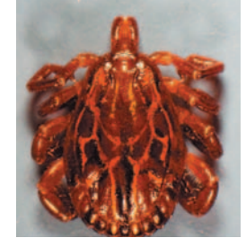
Male Gulf Coast tick

brought in by cattle from states along the Gulf. But persistent and early spring populations in the state can only be explained by overwintering populations. This tick was originally thought to be restricted to Gulf Coast States and up to southeastern Kansas. It is now found on cattle in central, northcentral, and northeastern Kansas.