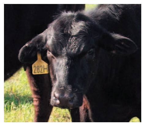
Cow with "gotch ear"

There are 41 products registered in Kansas for the control of Gulf Coast ticks. Rapid control of these ticks can be achieved with direct animal applications of pesticides, such