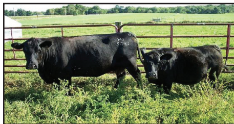
3-year-old long-nosed dwarf and dam

All the defects described in this edition of “Dead Cows Don’t Lie” are recessive, meaning that in order to have an affected calf BOTH sire and dam must be carriers. The status of animals (carrier of the defect vs. free of the defect) can be determined with DNA tests. These defects affect not only registered cattle but also commercial cattle, and they can affect purebred as well as crossbred cattle. Additional information about these defects can be found on the breed association web pages. Different laboratories require different samples for testing – consult your breed association for approved laboratories and the laboratory web site for required sample type.