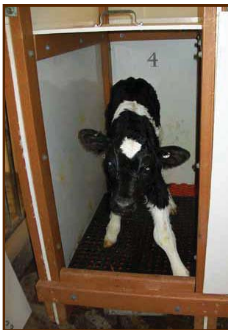
Calf warming boxes designed by the Michigan State University dairy team help control the spread of Johne's disease in the calving area.

The Michigan Johne's Disease Control Demonstration Project was a partnership between the MSU College (Continued on Page 4)