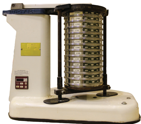
Figure 2. Tyler Ro-tap shaker machine with sieve stack