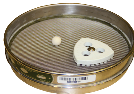
Figure 3. Example of one rubber ball and one bristle sieve cleaner.