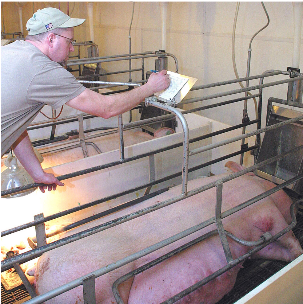
Farrowing records also are used for selection purposes, as well as for farm finances.

acid coefficients (Stein et al., 2007). Requirement studies have helped in the development of models, both to assist in determining the amino acid requirements, but also to estimate the economic impacts of potential changes in diet formulation.