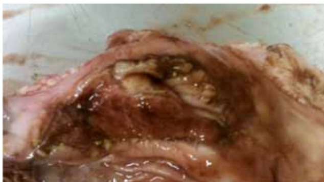
Figure 3. Esophageal opening of stomach with 100% ulceration (ulcer index score of 9). Keratinization and ulceration were scored by a single person at the time of slaughter from 4 pigs in each pen. Keratinization scores were assigned on a scale from 1 to 4 with 1 being normal or no keratinization of the esophageal region, 2 being keratin covering <25% of the esophageal region, 3 being keratin covering 25 to 75% of the esophageal region, and 4 being keratin covering >75% of the esophageal region (see above). Ulcer scores were also assigned on a scale from 1 to 4 with 1 being no ulcers present (see above), 2 being ulceration affecting <25% of the esophageal region, 3 being ulceration affecting 25 to 75% of the esophageal region, and 4 being ulceration affecting >75% of the esophageal region. An index of stomach morphology was developed by adding a pig's ulcer and keratinization scores. An additional score of 4 was added to each pig that had an ulceration score greater than 1.

worse stomach morphology, as ulceration is a product of keratinization and represents a stomach with a more progressed case of esophageal deterioration. Therefore, this index was developed so that a high score represents a stomach with more damage present from keratinization and ulceration. Before final marketing, all pigs were individually weighed and tattooed for carcass data collection. On d 112 (barrows) and 118 (gilts) of the trial, all remaining pigs were transported 246 km to a commercial packing plant (Tyson Foods, Waterloo, IA) for harvest. Standard carcass characteristics including HCW, carcass yield (calculated from HCW and farm weight), and percentage lean (lean % = 48.3575 - (6.38916 \times \text{backfat, mm}) + (4.424677 \times \text{loin depth, mm}) ) were measured and calculated using National Pork Producers Council (2001) procedures. Fat depth and loin depth were measured with an optical probe (SFK Technology, Herlev, Denmark) inserted between the third and fourth ribs of the right side of the carcass located anterior to the last rib at a distance approximately 7 cm from the dorsal midline.