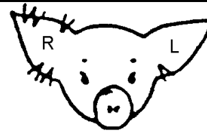
Notch # 47-1

*IMPORTANT - draw the notches exactly as they are in the ears!